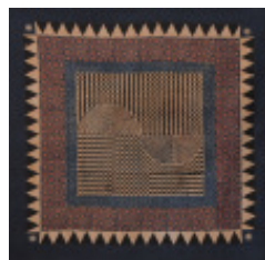
" Indigo Narratives- Modern Spinning Wheel " 72 x 46 inches Azrak resist dyeing on khadi fabric By Shelly Jyoti