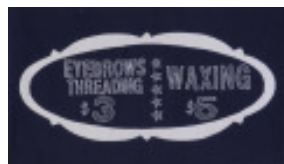
" Devon Ave, Sampler " 53 x 77 inches Acrylic on Canvas By Laura Kina