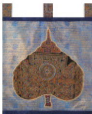
" Indigo Narratives- An Allusions to Stitches An Indigo Leaf " 40 x 33 inches Acrylic on Canvas By Shelly Jyoti