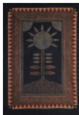
" Indigo Narratives- An Indigo Plant " 21 x 14 inches Azrak resist dyeing on khadi fabric By Shelly Jyoti