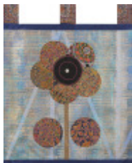
" Indigo Narratives- An Allusions to Stitches An Indigo Sapling " 21 x 14 inches Acrylic on Canvas By Shelly Jyoti

12th January 2010 to 18th January 2010 (AC Gallery) daily 11:00 am to 7:00 pm