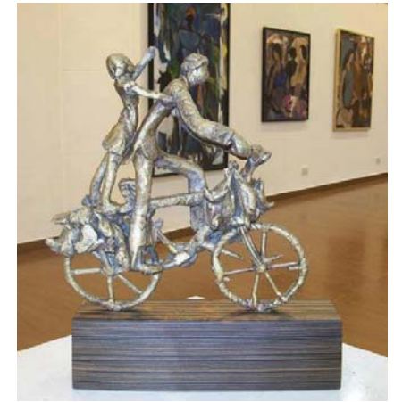
ATUL DAKE "To Market" 13.5" x 11" x 3" Metal Rs. 25,000