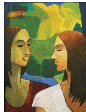
MEENAKSHI SADALGE "Two Friends" 24" x 18" Oil on Canvas Rs. 28,000