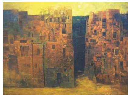
BALU SADALGE "City-II" 36" x 48" Acrylic on Canvas Rs. 80,000