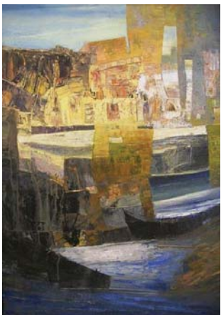
BALU SADALGE "Abstract Landscape" 34" x 23" Acrylic on Canvas Rs.38,000