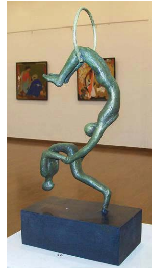
ATUL DAKE "Circus" 18" x 8" x 5" Metal Rs. 25,000