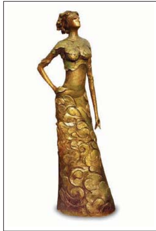
SANJIIVV SANKPAL "Fashion" 45" x 14" x 10" Metal Rs. 86,000