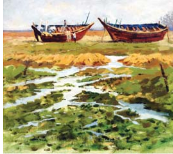
“Dry Dock, Mandvi” Acrylic on Canvas Rs. 6,000