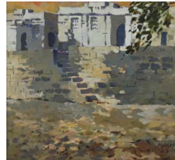
“Mata Tapkeshwari Temple” Acrylic on Canvas Rs. 5,000