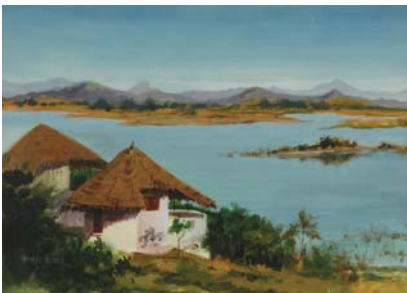
“Rudramata Lake” Acrylic on Canvas Rs. 8,000