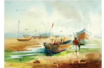
“Mandvi” Water Colour Rs. 8,000