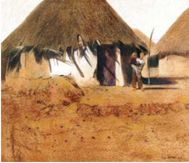
“Tundawand Village” Mix Media Rs. 8,000