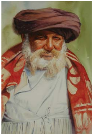
“Dasrat Kaka” Water Colour Rs. 18,000