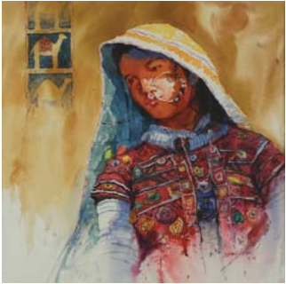
“Tribal Girl of Tundawand” Water Colour Rs. 8,000