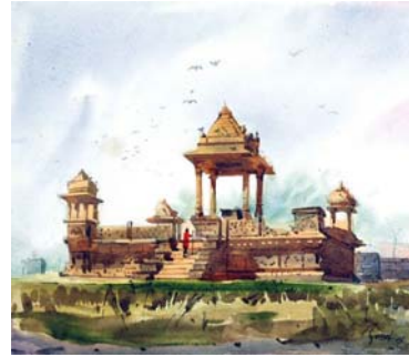
“Chatadi”, Bhuj Water Colour Rs. 5,000