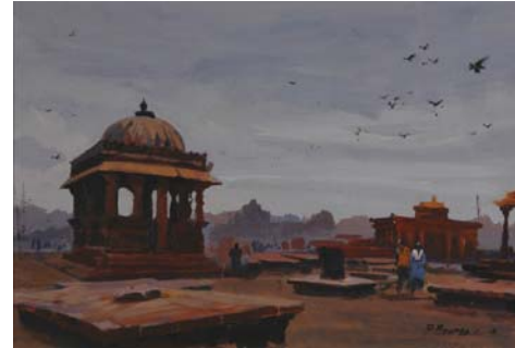
“Chatadi”, Bhuj Acrylic on Canvas Rs. 8,000