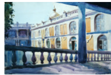
"Play of Shadow & Shade"

Size: 18 x 16.5 inches Water Colour on Paper Rs. 8,000 By Amol Pawar