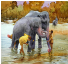
"Elephant Bath, Dubare Park"

28th April 2010 to 9th May 2010 (AC Gallery & Circular Gallery) daily 11:00 am to 7:00 pm