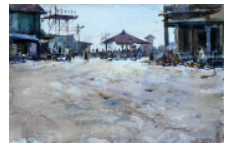
"Around Chamundi Temple"

Size: 30.5 x 18.5 inches Water Colour on Paper Rs. 8,000 By Ganesh Mhatre